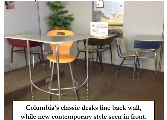
ergonomic and collaborative styles.

Columbia Manufacturing Inc. has operated at its Westfield, Massachusetts facility since 1877, and currently has a workforce of 70 employees, during their peak season. The company transitioned from bicycle manufacturing to school furniture manufacturing, currently producing classic desks,